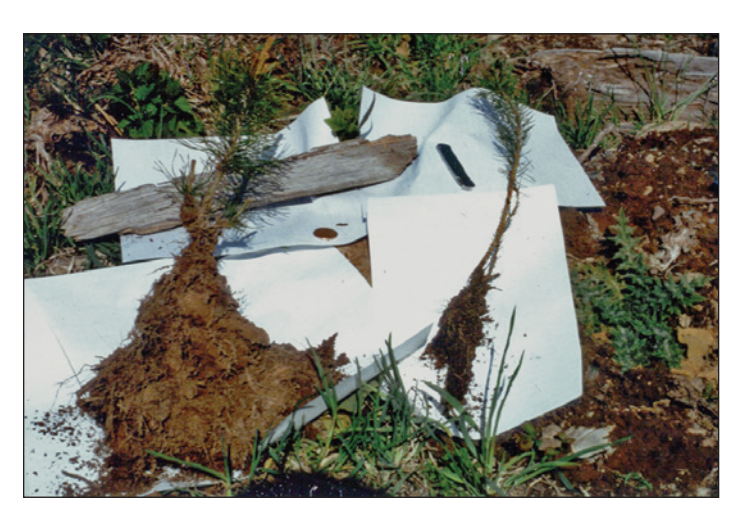
Figure 1. Reforestation managers must understand various impacts on seedling growth and survival to be able to be able to duplicate a favorable outcome and avoid the unfavorable outcome. For example, these 1-year-old lodgepole pine seedlings, both from the same seedlot and planted by the same planter, were planted in different microsites resulting in differing field performance.

Reforestation managers can also gather information at workshops and conferences, and can turn to experienced reforestation partners such as nursery managers, seedling growers, and extension specialists to ask questions and increase their understanding about such concerns as why seedlings are not growing well, or if a certain species/stocktype combination would be appropriate for a particular reforestation situation. These professionals are the people that the reforestation manager can contact for a detailed understanding about seedling physiology and how to help seedlings grow well at the reforestation site. For the nursery manager/grower, it is important to remember that reforestation clients will usually continue to purchase seedlings from your nursery when they are successful with their