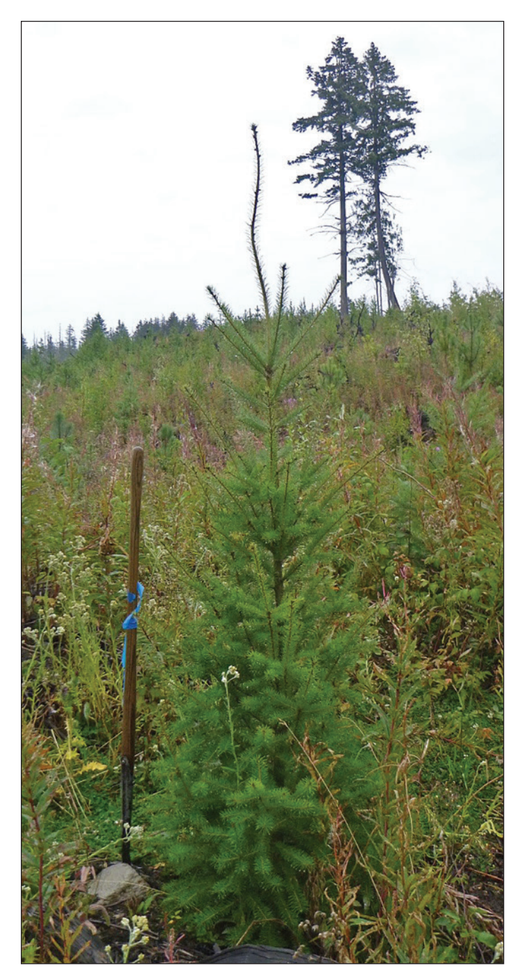
Figure 3. Ultimately, good communication and an abundance of knowledge and experience results in a team of nursery and field professionals that can ensure reforestation success such as this healthy, 6-year-old Douglas-fir seedling.