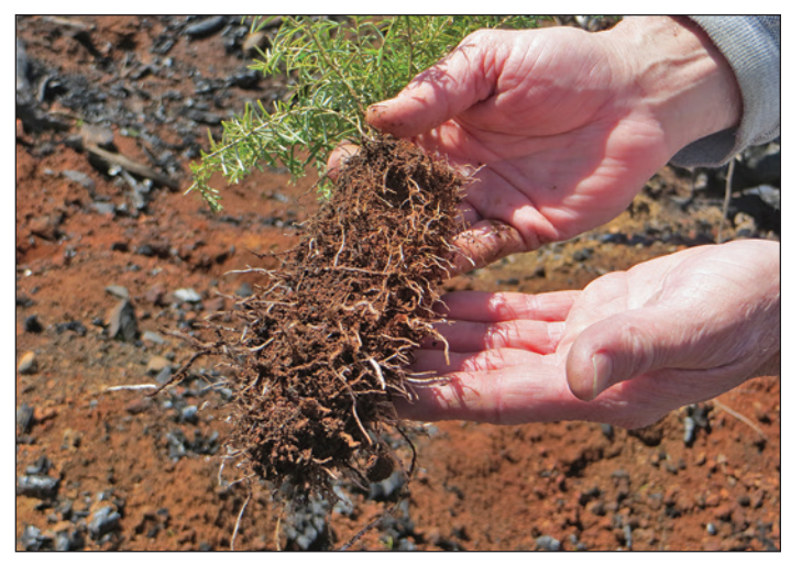
Figure 4. Good quality seedlings have vigorous roots that egress rapidly after outplanting, such as the Douglas-fir container seedling.

To encourage a quality seedling with well-developed roots, the grower must sow seed into a welldrained container growing medium (or bareroot seedbed) with adequate aeration (Landis et al. 1990) during temperature and moisture conditions suitable for germination and rapid root elongation. Irrigation is one of the most useful culturing tools in any nursery and can make all the difference between the production of high-quality or low-quality plants. Irrigation based on the plant's transpirational demands, target water content, and seedling growth phase is far more effective and efficient than irrigation on a set schedule (Dumroese et al. 2015). The best irrigation programs always involve watering to saturation and then allowing a dry down sufficient to ensure good root aeration. High irrigation levels tend to result in higher shoot-to-root ratio (Moser et al. 2014) and proliferation of pathogens and other pests (Dumroese and Haase 2018). Similarly, excessive fertilizer, especially nitrogen, promotes excessive shoot growth and an unbalanced shoot-to-root ratio (Landis et al. 1989).