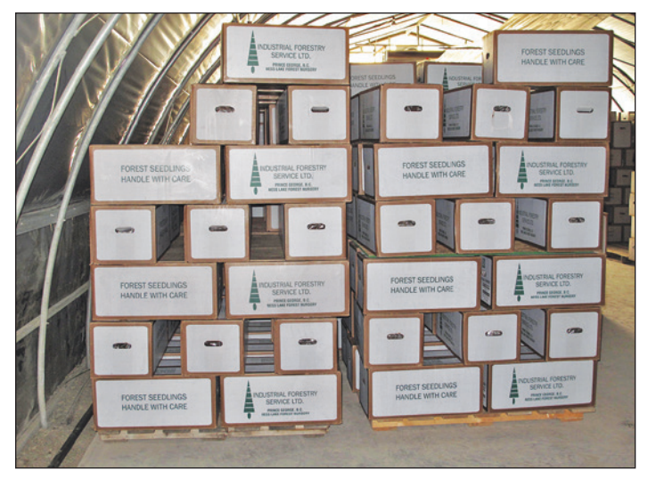
Figure 6. Rapid thawing of frozen seedlings in closed boxes can be done by spacing stacked boxes in a warm location without direct sunlight and rotating the boxes top to bottom.

storage molds (Rose and Haase 1997), minimizes depletion of carbohydrates (Silim and Guy 1997), and results in seedlings having later bud break and greater frost hardiness at time of planting (Camm et al. 1995). Seedlings can also be planted frozen without thawing, but must be individually wrapped at harvest such that seedling plugs can be separated from one another while frozen (figure 7). Eliminating the thawing process requires more effort in the nursery at lifting but offers operational flexibility during the busy planting window. Research to date has shown no deleterious physiological effects of planting frozen seedlings (Camm et al. 1995, Kooistra and Baaker 2005), although limiting site