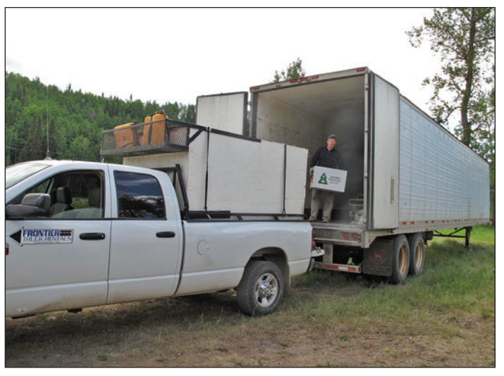
Figure 5. Refrigerated trailers are required for transporting large quantities of hot-lift seedlings from the nursery and are ideal for short-term cool seedling storage prior to planting.

Properly hardened summer/fall planted seedlings can be safely cold stored for approximately 4 weeks prior to outplanting without any chilling requirement (Jackson et al. 2012). Cultural practices to induce hardening (i.e., water stress and low N) resulted in container-grown loblolly pine seedlings being able to withstand 4 to 6 weeks of cold storage without prior chilling hours (Grossnickle and South