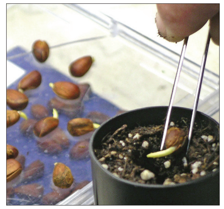
Figure 5. As whitebark pine seeds germinate, they are sown into individually labeled containers for emergence.