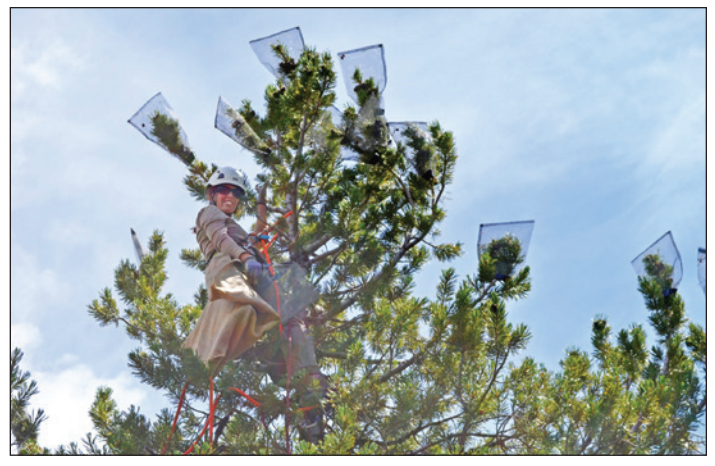
Figure 1. Caging whitebark pine conelets to prevent competition from nutcrackers and squirrels for seed crops.

fall. Cone collection is also expensive. To prevent competition for seeds from nutcrackers and squirrels, cone-bearing trees, often located in remote sites, must first be climbed in the spring and early summer to cage conelets (figure 1). Trees must again be climbed in the fall to collect cones.