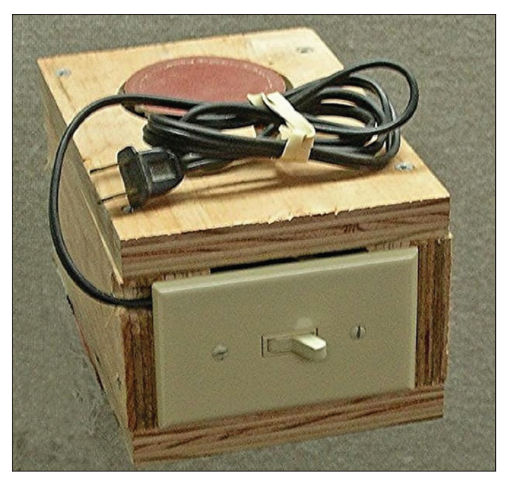
Figure 3. Sanding machine designed and constructed at DGRC for scarifying whitebark pine seeds before germination.

By 2014, germination of whitebark pine seeds under DGRC operational protocols ranged from 5 to 95 percent germination, depending on seed maturity, with an average germination of 71 percent. Although germination in most species depends on seed quality, maximum germination for even minimally viable whitebark pine seeds is important due to the high value of the seeds.