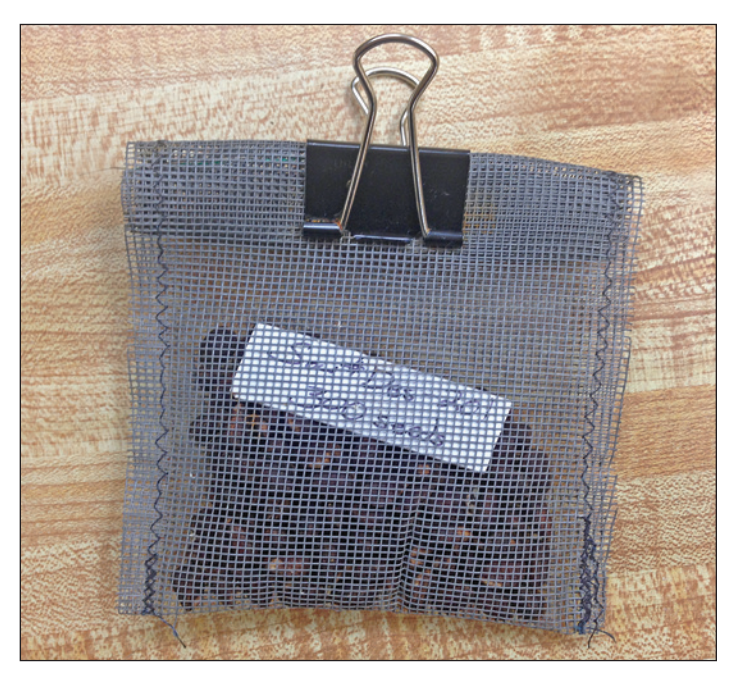
Figure 2. Mesh bags used for stratifying individual seedlots in tubs.

Operational seed-handling and germination protocols evolved at DGRC based on the results of these previous studies, eventually leading to operational protocols in use by 2014. Only seeds that had been stored for at least 1 year were sown for rust testing and outplanting. Seeds were placed in mesh bags (figure 2) and soaked for 24 hours in hydrogen peroxide ( H_2O_2 ), rinsed, and soaked an additional 24 hours in water ( H_2O_2 ). Mesh bags were placed in plastic tubs, placed in warm stratification at