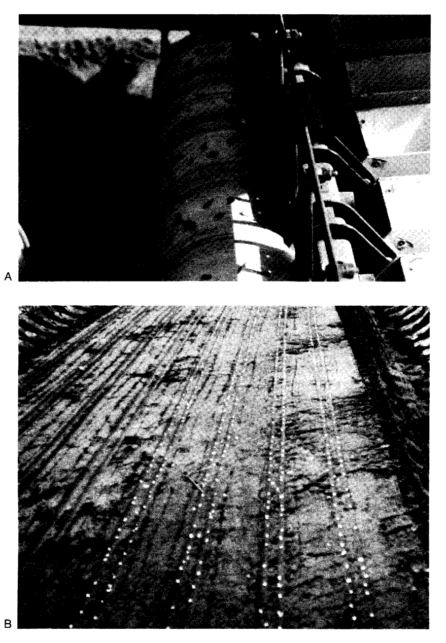
Figure 2 —Longleaf pine seeder with custom-built vacuum seed drum (A) designed for precision sowing of 8 offset double rows per seedbed (B).

ducted at the Taylor State Nursery in 1988 and 1989 had greater than 95% purity and greater than 70% germination potential. Modifications to the Summit machine included the addition of an agitator in each seed hopper to minimize the "bridging" effect of large, partially winged, and irregularly shaped longleaf seed (fig. 1). The agitator also minimized seed "doubles" by promoting the attachment of a single seed at each seed hole on the drum. A second modification involved custom-built seed drums to either sow 8 double offset rows per seedbed (fig. 2) at the Taylor Nursery or 15 single rows per seed bed (fig. 3) at the Ashe Nursery. A third modification at the Taylor Nursery involved the addition of a computer system for controlling seeding rates (fig. 4). This machine was purchased by the United States Department of Energy for the production of highquality longleaf pine seedlings at the Taylor Nursery as part of a cooperative 5-year contract for forestation at the Savannah River Site, Aiken, SC. The supplemental modifications were made by the manufacturer in 1988.