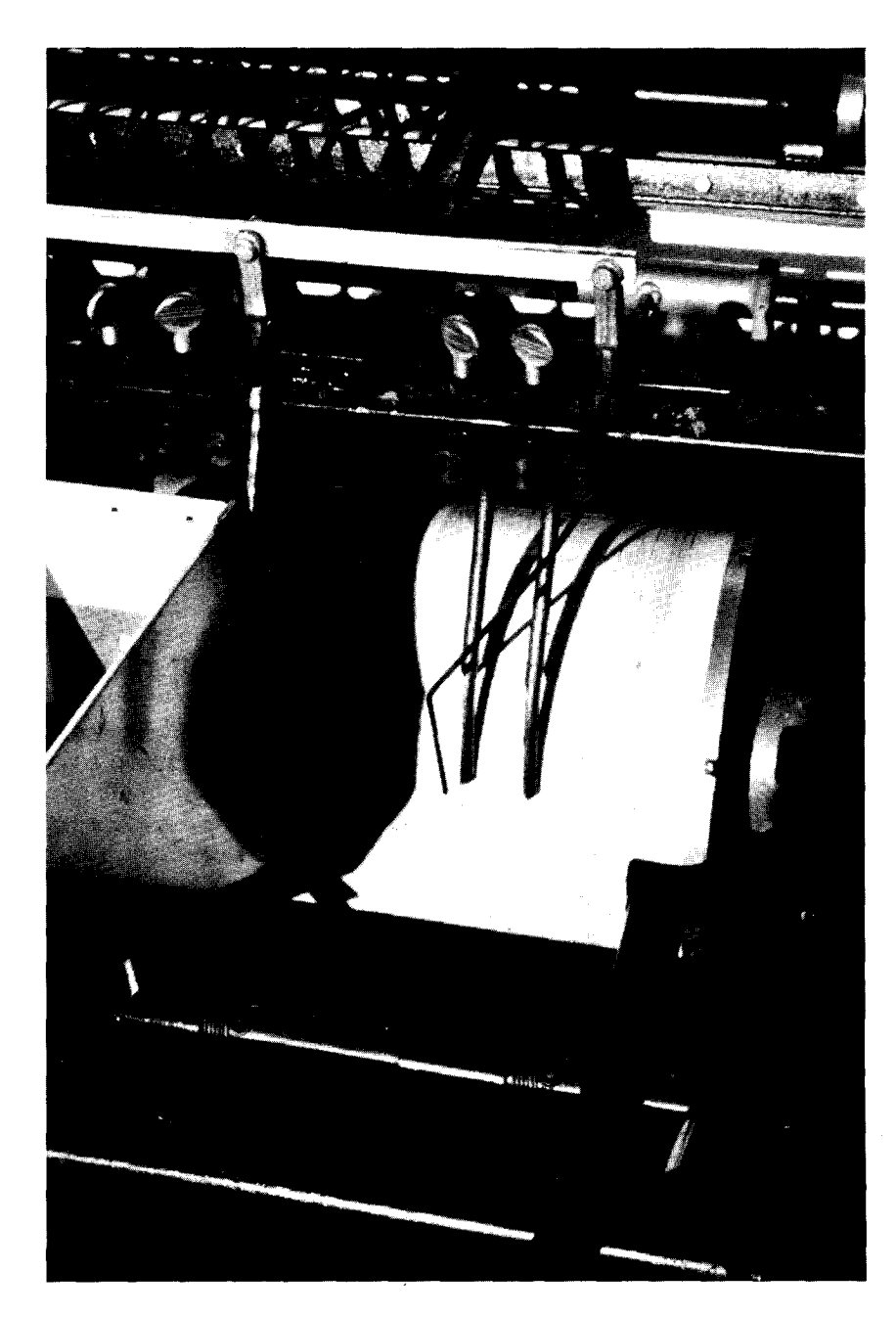
Figure 1---Modified longleaf pine seeder showing added agitator in each seed hopper.

Consequently, the Summit seed sower was modified to accommodate the irregularities of longleaf pine seeds. The first requirement was to obtain high-quality seeds. Those used in seeding trials con-