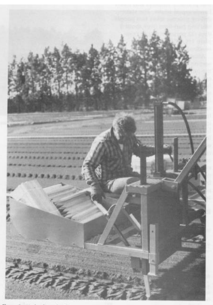
Figure 2-Hydraulic stake driver.

The improved netting application process incorporates both the hydraulic stake driver and the rickshaw net spreader. The hydraulic stake driver can be mounted on any tractor that has remote hydraulics and a 3-point hitch. It requires one tractor operator and one person riding the stake driver. An experienced operator can drive about 1,800 stakes per hour. Stakes are 3/4 inch by 1<sup>1</sup>/<sub>2</sub> inches by 16 inches and are driven an average of 6 to 8 inches into the ground. The machine can be set to drive stakes at various depths as required by the nursery (fig. 2). Wooden stakes are made to measure by the Central Oregon