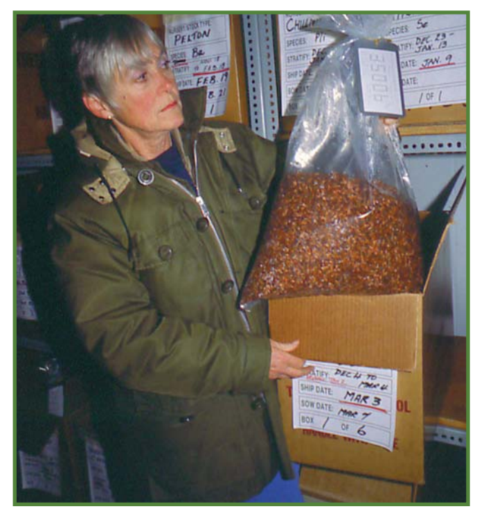
Figure 72 Monitoring of seeds during cold stratification.

Pelleting was shown to have a negative impact on germination in white spruce, jack pine, and red pine, but did not influence germination in black spruce. If black spruce was sown at suboptimal germination temperatures, germination was adversely affected by pelleting. Pelleted black spruce can be stored for three years without adverse effect on germination (Fraser and Adams 1980).