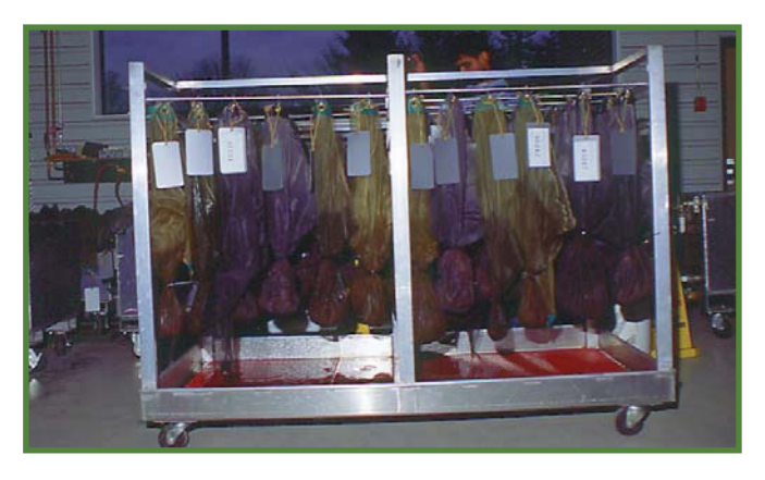
Figure 67 Draining seeds of extra moisture following the running water soak.