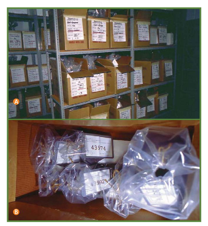
Figure 71 Seeds in stratification: a) a view of sowing requests in stratification and b) illustrating the open bag for increasing oxygen exchange.

high germination with western white pine the maximum bag size is set at 1000 grams to allow for additional aeration and closer observation of the seeds during stratification. Optimization of stratification methods are currently being investigated for western white pine. During stratification monitoring of seed condition is important and may be accompanied by the gentle massaging of the bags or rotating the seeds to ensure anaerobic conditions do not build up in part of the bag, especially with species requiring long stratification (Figure 72).