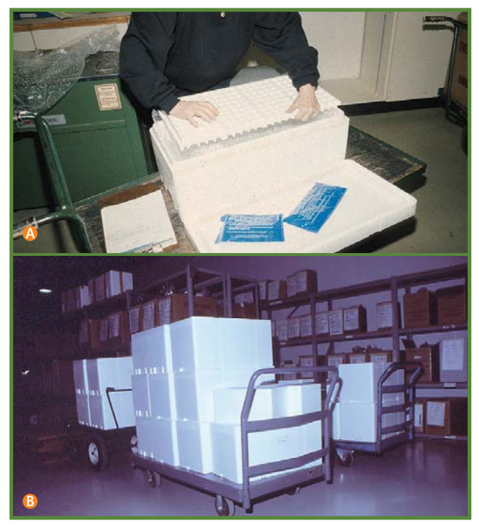
Figure 73 Contents of a seed shipment a) including ice packs and insulating material and b) a seed shipment awaiting pickup in the cooler.