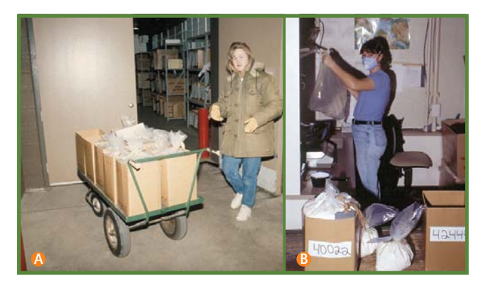
Figure 65 a) Withdrawing seeds from long-term storage and b) weighing pelleted western redcedar seeds for a sowing request.

primarily received within the few months that sowing occurs in BC. This is one area where differences between germination test results and germination of sowing requests can arise. A summary of all areas in which differences in germination results could occur is presented in the nursery results chapter.