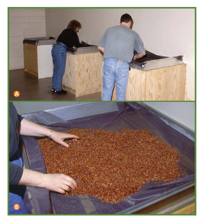
Figure 68 Surface drying seeds a) illustrating a drying room that utilizes vents which draw moisture off the seed coat and b) a close-up of the manual movement of the seeds required for attaining uniform surface drying.

Surface drying following fication is advocated by some because maximum moisture content may not be obtained during the hydration period (Edwards 1996). Tanaka et al. (1986) do not recommend surface drying before stratification as germination speed may be reduced, but in this case a standard drying regime (25°C for