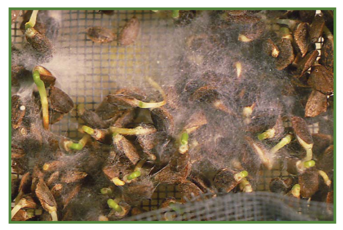
Figure 70 Problems associated with the former protocol of using warm stratification in western white pine: mould build-up and pregermination of non-dormant seeds in a seedlot.

weeks stratification and given an additional eight weeks stratification similar to the stratification-redry treatment which has been shown to be advantageous (Edwards 1986; Edwards 1996; Leadem 1986; Tanaka and Edwards 1986). Tactile and visual cues are also used to gauge the dryback procedure and average dryback moisture content results are shown in Table 9. The other two species are not surface dried because of concerns with structures restricting water uptake to the megagametophyte and embryo (Hoff 1987; Tillman-Sutela and Kauppi 1998). Although yellow-cedar still receives a period of warm stratification the elimination of this procedure in western white pine greatly improved the quality of seeds shipped as mould buildup and pregermination were virtually eliminated (Figure 70).