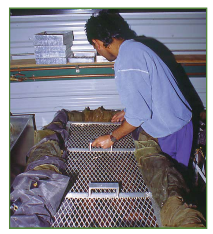
Figure 66 Placing sowing requests into a running water soak tank with a cover to ensure all seeds are submersed.

The temperature of water used for seed hydration may affect the amount of moisture absorbed and possibly seed and seedling performance. It is generally accepted that at higher water temperatures imbibition will be faster, but Edwards (1971) found that if the imbibition period in Noble fir was extended past 14 days, a 5°C soak produced higher seed moisture content compared to a 25°C soak. Imbibition in