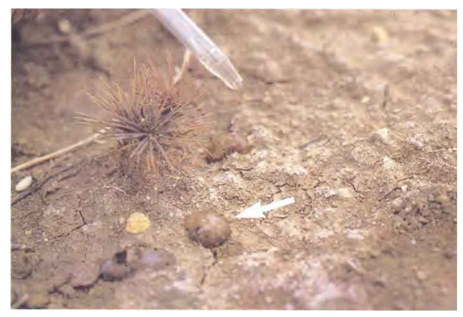
Figure 31-3. The presence of excessive calcium salts can be confirmed by placing a drop of dilute acid on the soil to see if effervescence occurs.