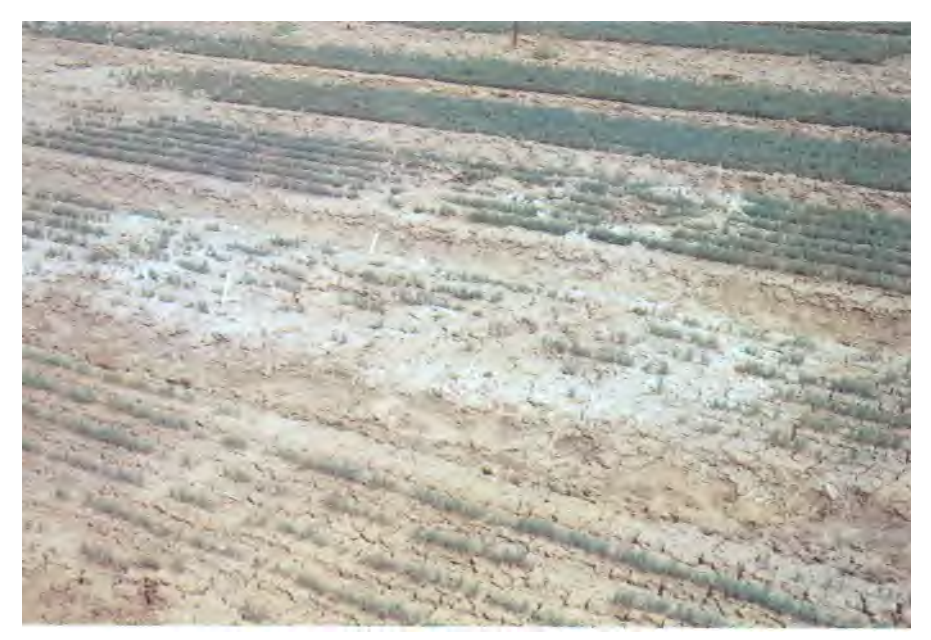
Figure 31-2. Soils dominated by calcium salts often exhibit white surface crusts.

Poor soil-management practices can lead to accumulation of salts in the seedling root zone, especially in fine-textured soils. Improper or excessive soil cultivation can break down soil structure, reducing porosity and inhibiting water infiltration and drainage. Repeated use of heavy equipment in seedbeds can produce impermeable soil "pans" within the soil profile, further restricting drainage.