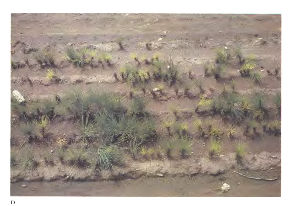
Figure 31-1. Foliar symptoms caused by salt injury: (A) chlorosis, (B) and (C) scorched needle tips, and (D) mosaic growth pattern of normal and stunted seedlings.

growth pattern of normal and stunted seedlings (Figure 31-1). Seedlings growing in saline soils often do not develop fibrous root systems. Soils dominated by calcium salts often exhibit white surface crusts (Figure 31-2) that effervesce when tested with a drop of dilute acid (Figure 31-3). Soils with a high proportion of sodium salts, on the other hand, are blackish in color and have a slippery texture.