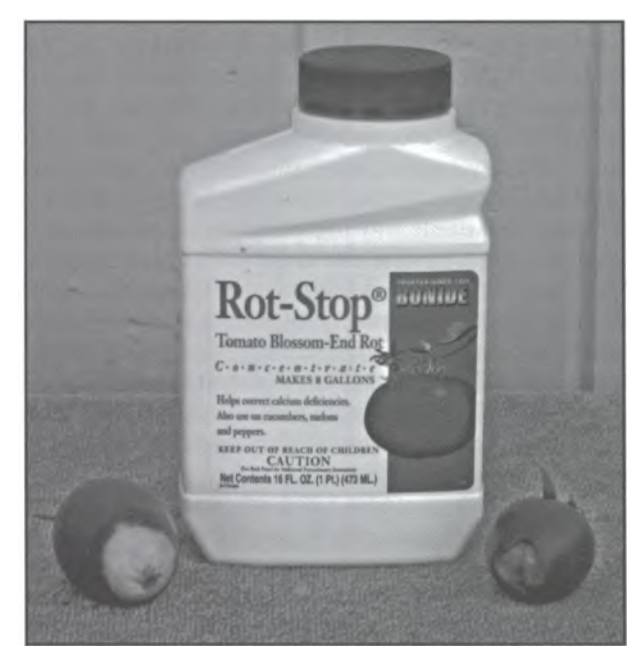
Figure 3 - Calcium chloride is widely used as a foliar treatment for the physiological disease known as "blossom end rot" of tomatoes, but this fertilizer is not commonly used in native plant nurseries.