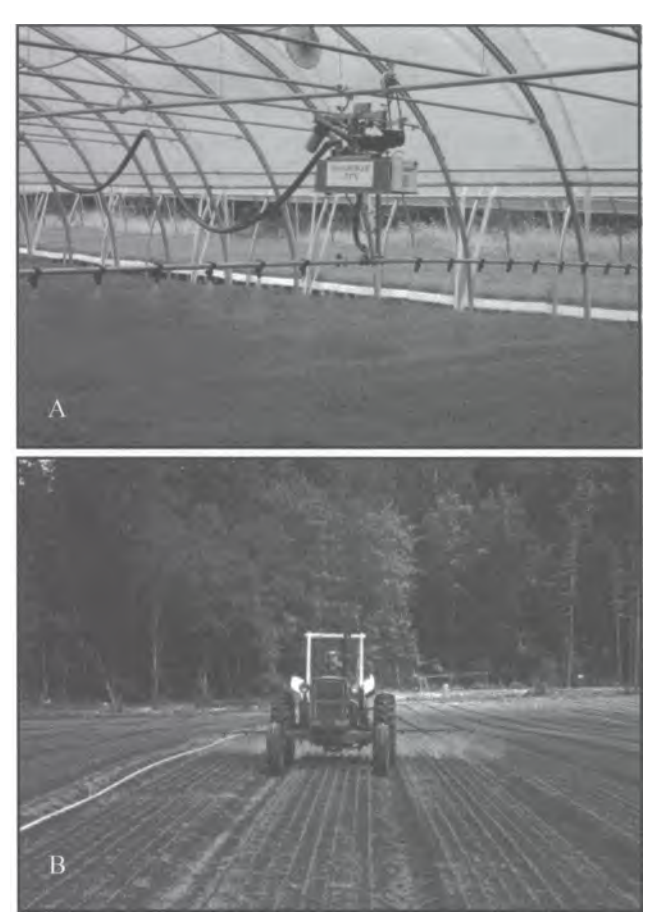
Figure 2 - Fertigation is the only way to ensure that each container receives the same amount of fertilizers (A). Bareroot nurseries are starting to apply the lessons learned from container culture and applying soluble fertilizers to their fields (B).

however, the base levels of these 2 mineral nutrients in irrigation water varies considerably. The amount of sulfur in irrigation water also varies widely: a recent survey from across the US found that 4% of the water samples contained no sulfur, and another 65% contained less than 10 ppm. Compared to a target level of around 60 ppm, this is too low to supply the needs of rapidly growing seedlings.