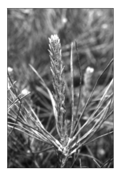
Figure 4 - Trees and shrubs with indeterminate growth should be top pruned before the expanding terminal shoot becomes woody; in pines, this is called the "pinfeather" stage.

Of course, the objectives of the seedling user would determine whether initially forked plants would be a problem. Foresters are concerned about producing trees with straight boles but forking would not be important for nursery stock used for restoration or other non-