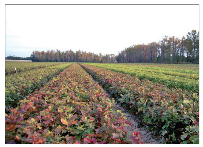
Figure 11d.1 —Shumard oak in November, 2008. These trees are ready to be lifted.

The onset of dormancy is almost entirely weather-dependent. Seedlings will exhibit more dormancy as the temperatures drop in the fall. A fairly good indicator of dormancy is the timing of leaf fall (see table 1 in chapter 11c), although some species tend to hang on to their leaves even after several frosts, such as sweetgum ( Liquidambar styraciflua L.) and the oaks ( Quercus spp.) (fig.11d.1). Dormancy can also be estimated with the amount of chilling hours received at the