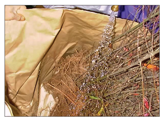
Figure 11d.13 — Spraying gel on roots inside bag prior to shipment.

A company employee can supervise the culling procedure and train contract workers to help with this process. Species-specific culling criteria are communicated to the contract crew involved in the actual lifting process. The culling procedure requires the use of a measuring stick, tape measure, and digital calipers, and is closely monitored to ensure that seedlings meet customer specifications.