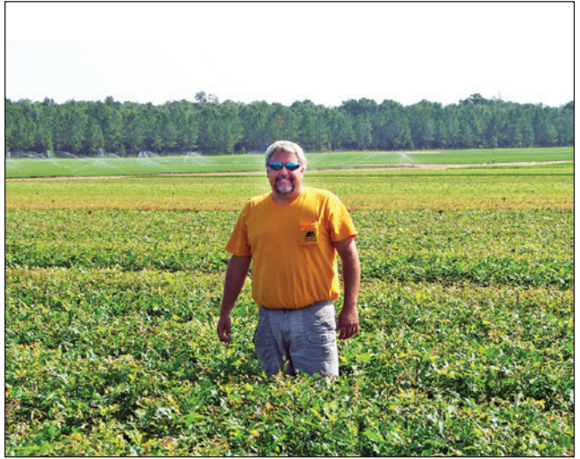
Figure 11d.4 — A field of Quercus spp after being top-pruned in August, 2008.