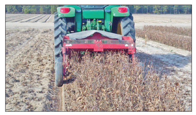
Figure 11d.9 — Fobro <sup>®</sup> Lifter.

There are some safety issues that apply to most lifters: