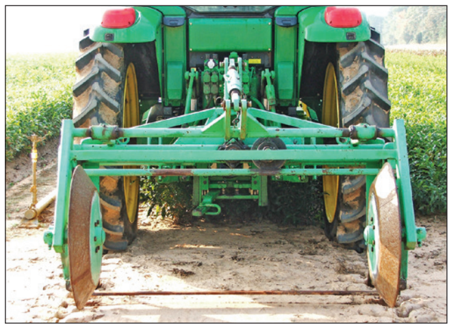
Figure 11d.5 — Sawtooth oak being undercut in November, 2007.