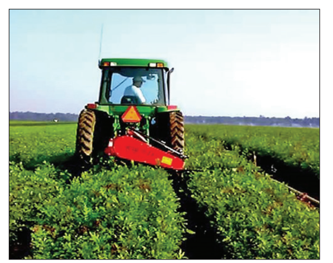
Figure 11d.2 — Nuttall oak being top pruned in September, 2005.

(fig. 11d.3). A double-action mower cuts in both directions on the cutting bar as the blades reciprocate, thus making a cleaner cut. As with any morphological modification of seedlings, extreme care should be taken to ensure a healthy, vibrant seedling is produced (fig. 11d.4).