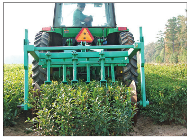
Figure 11d.8 —Whitfield<sup>®</sup> lateral pruner over sawtooth oak.

types, customer demands, and, to some degree, expected weather conditions. The following equipment is the minimum needed: two tractors, two haul-in wagons to transport seedlings from the field, a lifter (such as a Fobro), a vehicle (preferably a pickup truck), and a radio for communications. Another small but often important item required is a bed map describing the location of each species in the nursery beds.