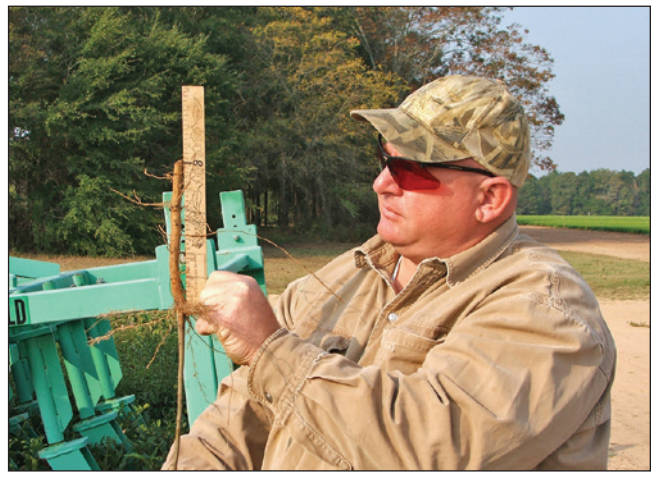
Figure 11d.6 —Root system of sawtooth oak after undercut in November, 2007.

There are three principal objectives for lateral root pruning. The first objective is to shorten the lateral roots to