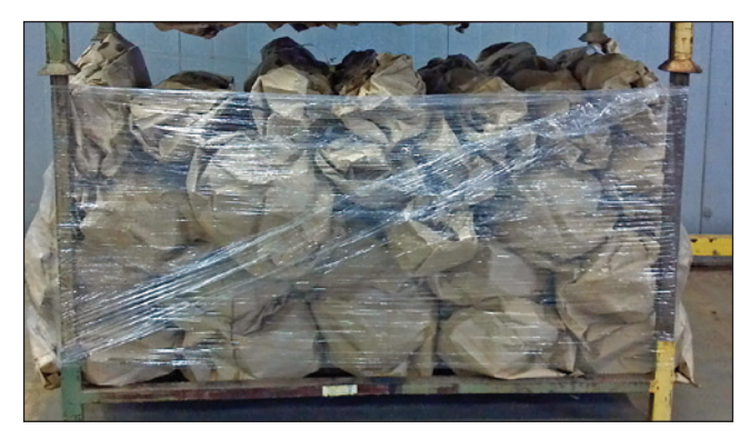
Figure 11d.14 — Sawtooth tree seedlings in storage on racks.

(1.1 by 1.8 by 1.1 m). They are easily handled with a forklift and can be stacked four high inside the cooler or two high inside a refrigerated van. A temperature and humidity monitor is mounted on the upper wall inside the cooler. This equipment feeds a constant stream of readings to two wireless consoles located in the main office. The readings are real-time with an alarm for unsuitable conditions in the cooler—lower than 90-percent humidity and/or below 34 and above 36 °F (below 1 and above 2 °C).