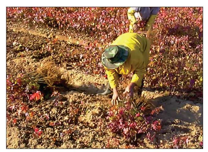
Figure 11d.11 — Field crew lifting sweetgum in January, 2008.

be necessary to use as many as 30 crew members to harvest the quantity needed for that particular day's schedule. The members of the lifting crew are separated by 10 to 12 ft (3 to 3.6 m) along the bed to prevent soil or leaf residue from flying onto their fellow workers. This separation also increases production. As the crew progresses down the bed, the crew members maintain this interval, harvesting their section of the bed then moving forward to the head of the lifting line. As the seedlings are harvested, they are culled and counted into bundles of 25 or 50, depending on species or customer request. The seedlings are placed on the ground in these bundled counts (fig. 11d.11). A separate crew of two to four members follows the lifting crew and immediately places the seedlings in paper bags. Bags are kraft paper with a thin, wax-coated liner (fig. 11d.12). Because seedlings have been top pruned, they can be laid horizontally in the bag,