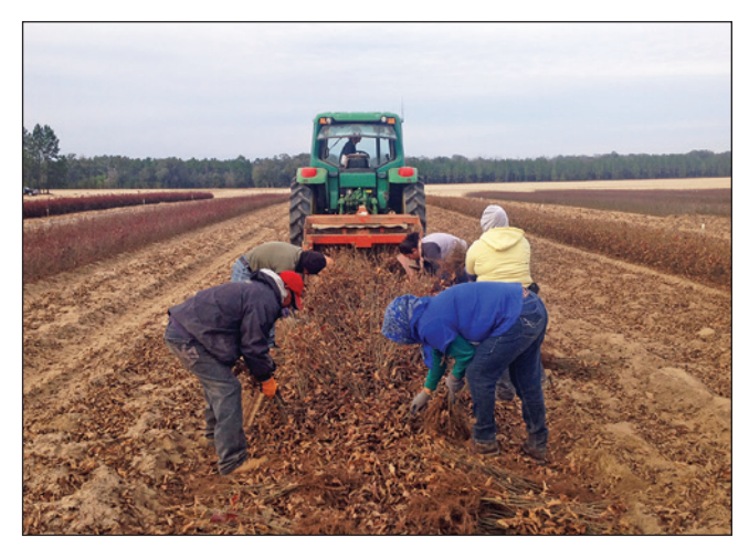
Figure 11d.10 — Field crew lifting hardwoods.